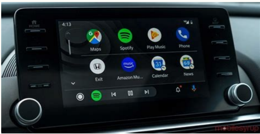
How to set auto sync on android. Best auto sync app for android. What is android auto sync. How do i turn on auto sync on android.