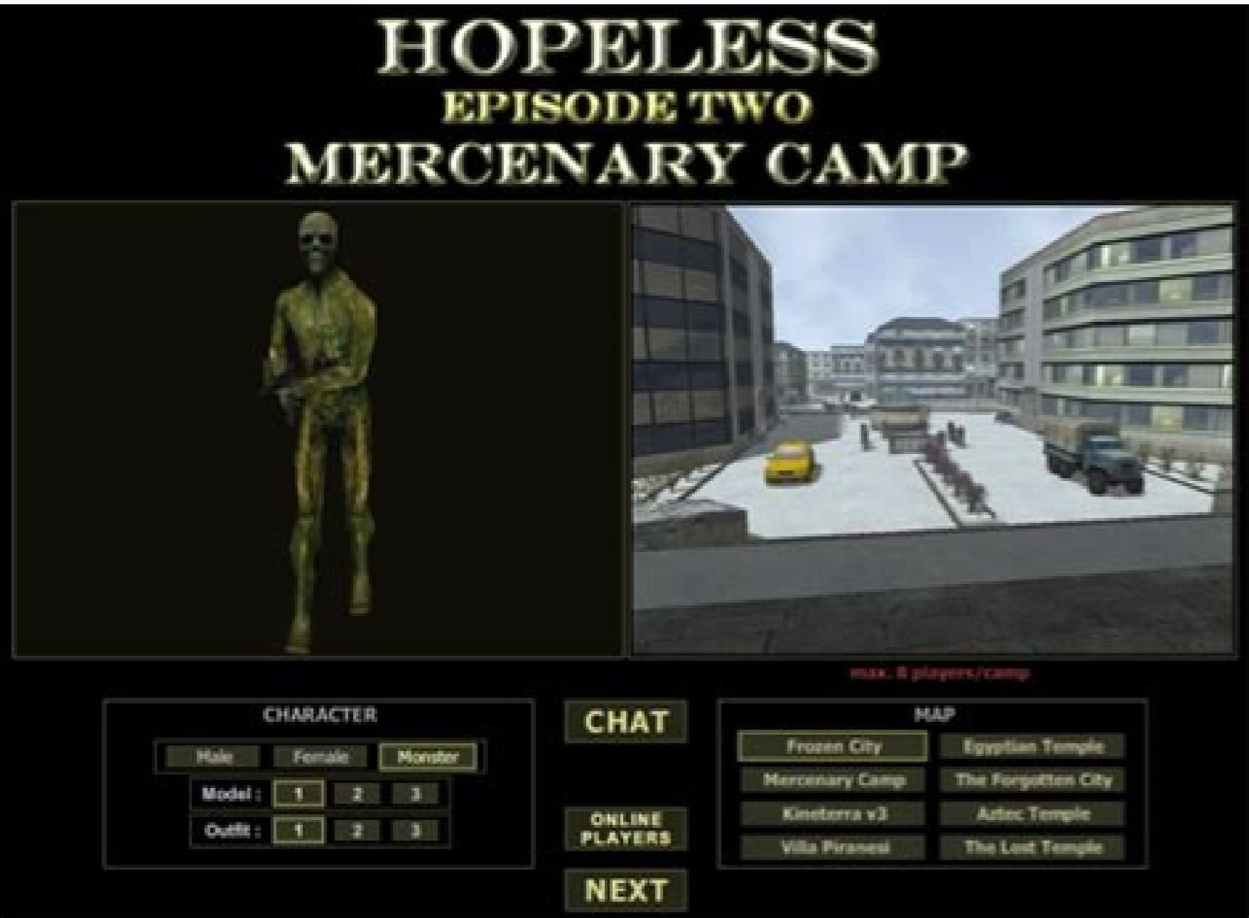
Download game hopeless 3 mod apk.